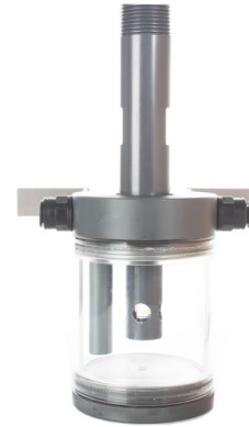
Single Closed Flow Cell

5. Choose how many digital inputs (for things like flow or level switches) you will need.