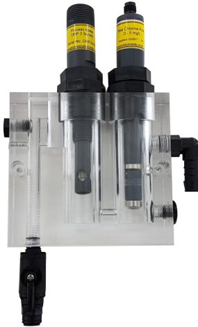
Double Open Flow Cell

4. Choose any flow cells or autoflushes that you might need for your sensors.