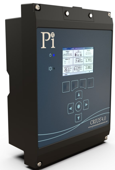
Pi's CRIUS® 4.0 Analyser